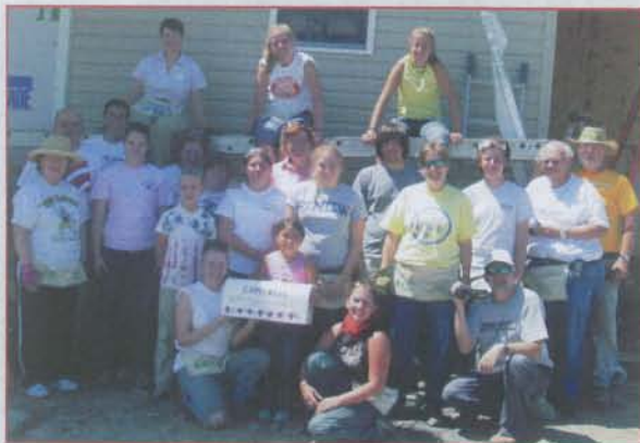
Forest Hills Presbyterian Church of High Point, North Carolina completed the House Raising Challenge in July of 2008.

However, The Challenge is a premium volunteer experience. Some skilled groups may find it more “challenging” and fulfilling than our traditional volunteer program.